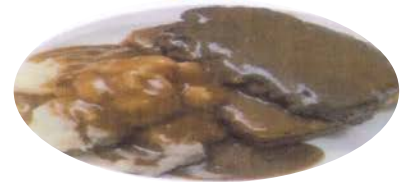
Hot Country Fried Steak with Soup | 11.99