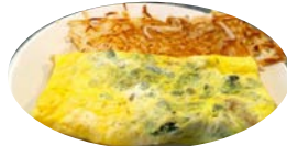
2 Egg Cheese Omelet With hash brown potatoes | 6.49