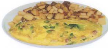
Mushroom n' cheese Omelet | 11.29 Sausage n' cheese Omelet | 11.29