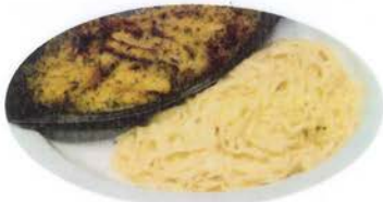
Chicken Dejonghe Breast of chicken strips, topped & baked with our special dejonghe garlic butter. Served with Fettuccine Alfredo and Soup or Salad | 16.49