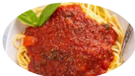
Spaghetti & Sauce | 6.49