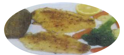
Catfish Parmesan Two catfish fillets seasoned Parmesan style and grilled with choice of potato and Soup or Salad | 14.99