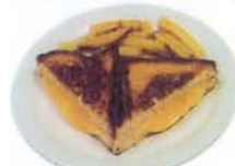
Grilled Cheese With fries | 6.49