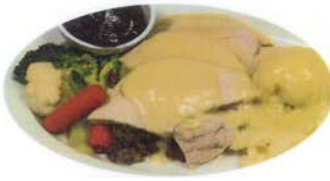
Roast Turkey Roasted gourmet turkey breast over homemade stuffing, topped with gravy and served with cranberry sauce and Soup or Salad | 14.99