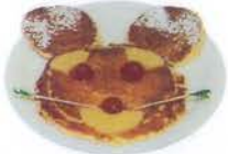
Your Lovely Mickey With butter and syrup | 5.99

All kids orders include one drink (milk, juice, chocolate milk, or hot chocolate - NO REFILLS) or soft drink (FREE REFILLS)