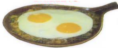
The Hobo Skillet | 11.49