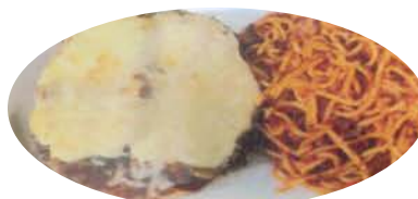
Veal Parmesan Sautéed veal cutlet, topped with & baked with Mozzarella cheese and served with spaghetti & marinara sauce with Soup or Salad | 15.99