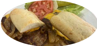
Poor Boy with Soup | 11.79