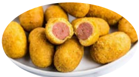
Mini Corn Dogs | 6.79