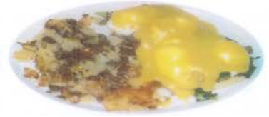
The Southern | 11.49