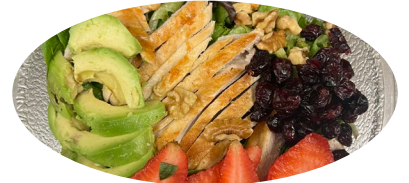
Tropical Walnut Chicken Salad Spring lettuce chicken salad with Walnuts and soup | 12.49