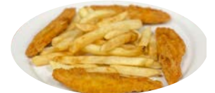
Chicken Tenders With fries or fruit dish | 6.79