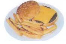
Cheeseburger or Hamburger With fries or fruit dish | 7.45

NOTICE: Consuming raw or undercooked meats, poultry, seafood, shellfish or eggs may increase your risk of food born illness, especially if you have certain medical conditions.