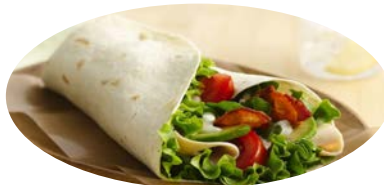
California Wrap with Soup | 11.79