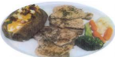
Greek Pork Chops Four thin center cut pork chops, pan fried with olive oil, lemon and oregano Greek style with choice of potato and Soup or Salad | 15.99