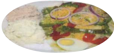
Chicken or Tuna Salad (or combo) with Soup | 12.99