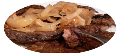
Liver & Onions Fried beef liver with mashed potatoes topped with grilled onions or bacon and Soup or Salad | 13.99