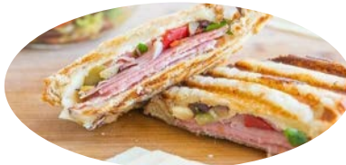
Panini Classico with Soup | 11.99