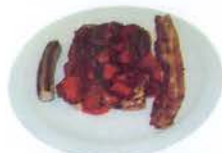
French Toast With fruit topping and one strip of bacon and one sausage link | 6.49