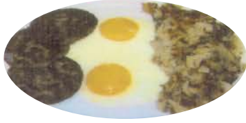
Two or Three Eggs with sausage patties | 10.99