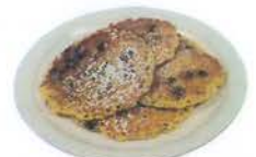
Chocolate Chips Four little pancakes stuffed with real chocolate chips | 5.99