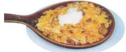
Tuscany Frittata | 11.49