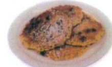
Chocolate Chips Four little pancakes stuffed with real chocolate chips | 6.49