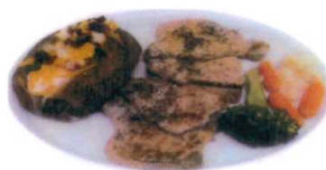
Greek Pork Chops

Chunks of Chicken Breast with Fettuccine Pasta and sautéed in Alfredo sauce with Soup or Salad | 16.99