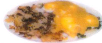
Turkey, Ham and Bacon | 11.99