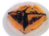
Grilled Cheese With fries | 6.99