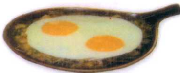
La Fiesta | 11.99