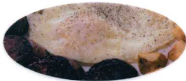
Two or Three Eggs w/ Polish Sausage | 11.99