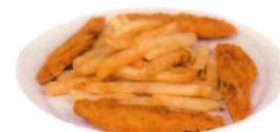
Chicken Tenders With fries or fruit dish | 6.99