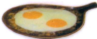
Country Skillet | 11.99