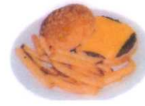
Cheeseburger or Hamburger With fries or fruit dish | 7.99 | 7.45

NOTICE: Consuming raw or undercooked meats, poultry, seafood, shellfish or eggs may increase your risk of food born illness, especially if you have certain medical conditions.