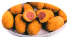
Mini Corn Dogs | 6.99