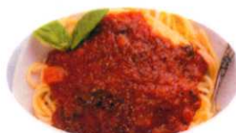
Spaghetti & Sauce | 6.99