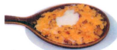
Blue Bay Frittata | 11.99

For Item Descriptions - Please Refer To The Menu