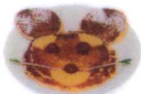
Your Lovely Mickey With butter and syrup | 6.49

All kids orders include one drink (milk, juice, chocolate milk, or hot chocolate - NO REFILLS) or soft drink (FREE REFILLS)