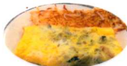
2 Egg Cheese Omelet With hash brown potatoes | 6.49