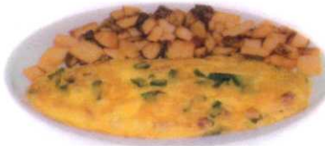
Corned Beef Omelet | 11.99