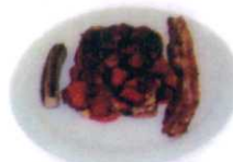
French Toast With fruit topping and one strip of bacon and one sausage link | 6.49